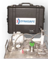
Gas Sampling Unit