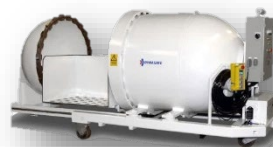
Straight Door Opening