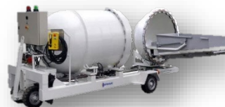
270° Rotating Door

Gas Sampling Unit: pulls liquid and/or vapor samples pre- and post-blast from closed chamber for analysis