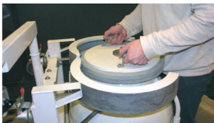
Opening of a DynaSEALR P6