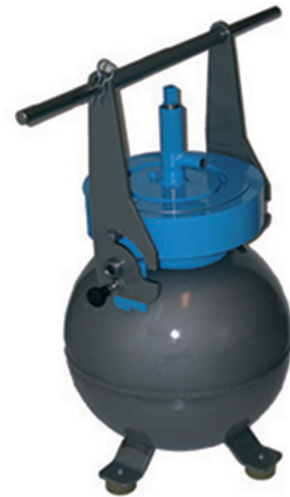
DynaSEALR P 3