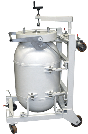
DynaSEALR P 6