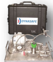
Gas Sampling Unit